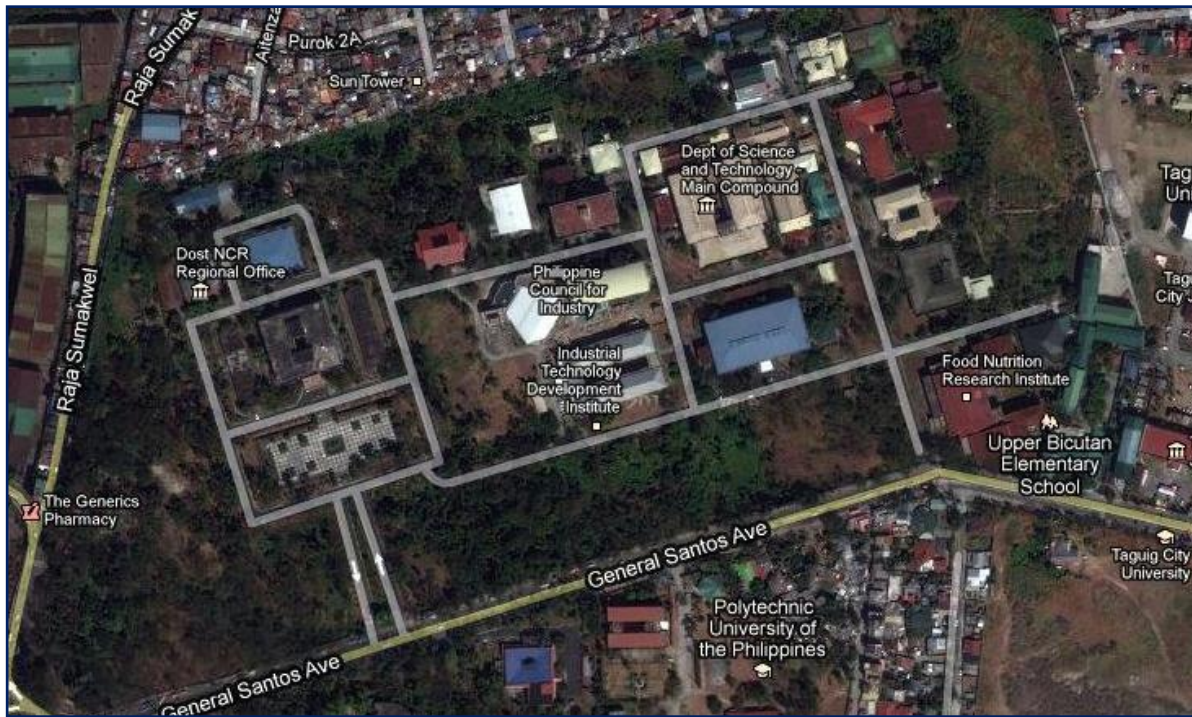
Aerial Map Around DOST Compound